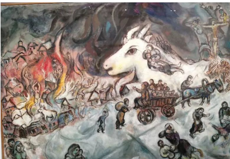
M. Chagall: Wyrtebsk