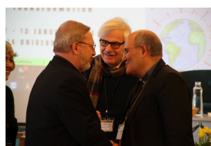
Politician, Intellectual, Church leader in dialogue - Sophia University Jan. 2024

In order to credibly solve the problem of conflicts between interests and values, politics must become the art of good and overcome politics as a technique of evil. More precisely, politics must become an art of turning enemies into friends, rather than a technique of struggle. In fact, the fundamental question of the political is not the conflict between good and evil, but the conflict between two goods.