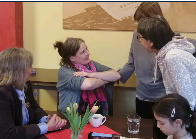
Members of DIALOP in dialogue with the KPÖ-mayor of Graz (Austria) on woman's day

WE ENTER INTO DIALOGUE ON TWO LEVELS: THE FIRST IS A DIALOGICAL TENOR; THE SECOND IS A METHODOLOGICAL EXPERIMENT.